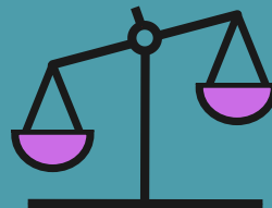
Figure out studies' importance.